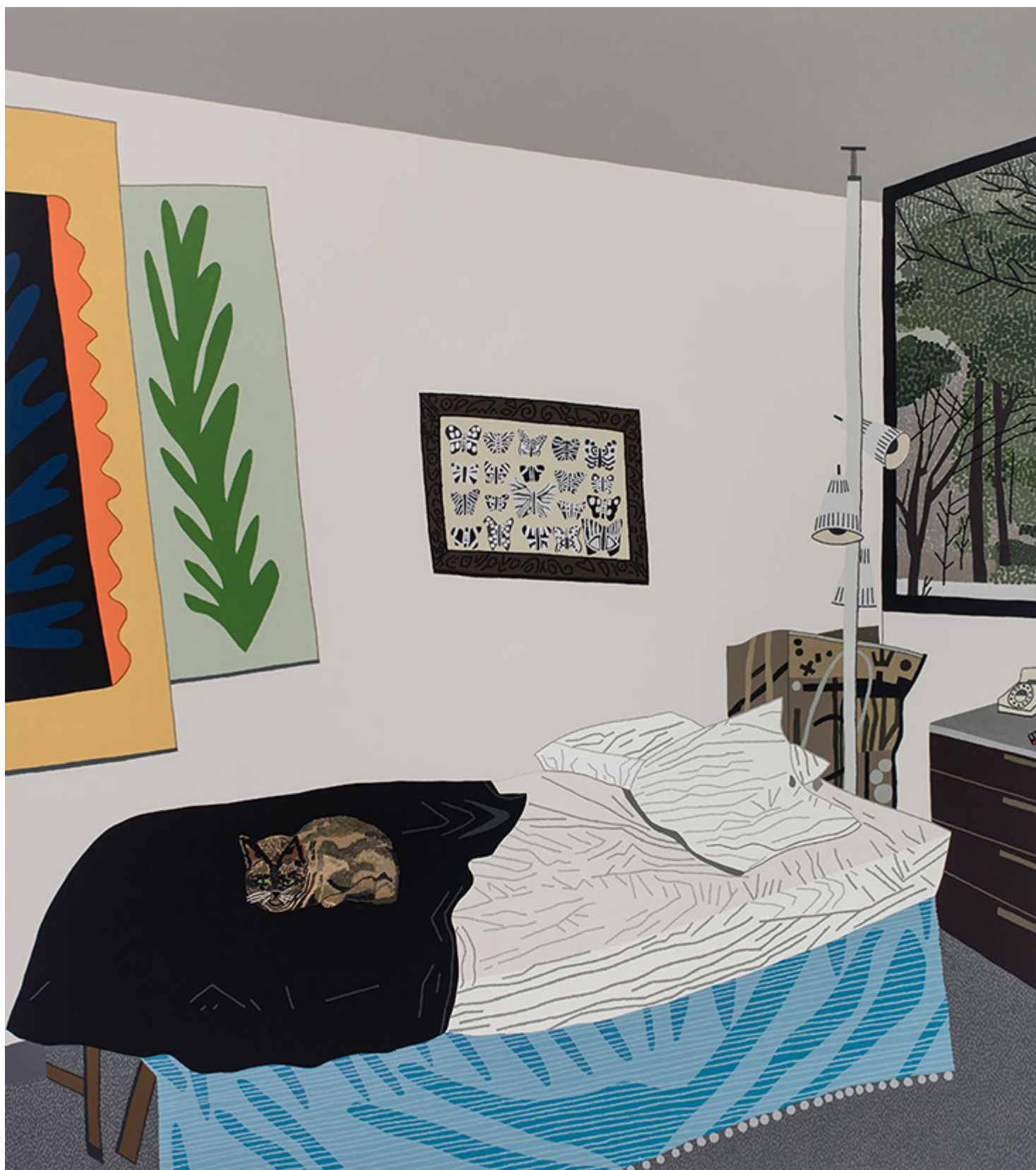
Helen's Room / Jonas Wood / 2017