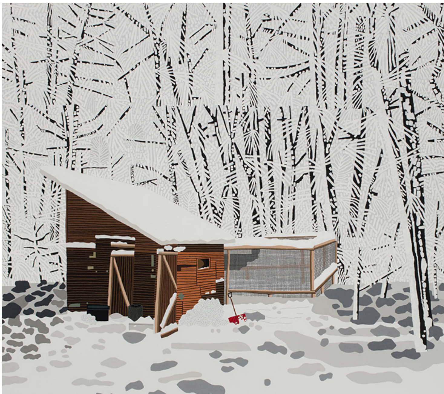
Snowscape with Barn / Jonas Wood / 2017

choice to enter the arts as an adult seem natural. He was particularly influenced by the props his mother made for school plays, remembering, “It was a really big deal in retrospect that I was around sets and plays and props. Because my paintings are like that, in a way. They are not real. They have a theatrical vibe.”