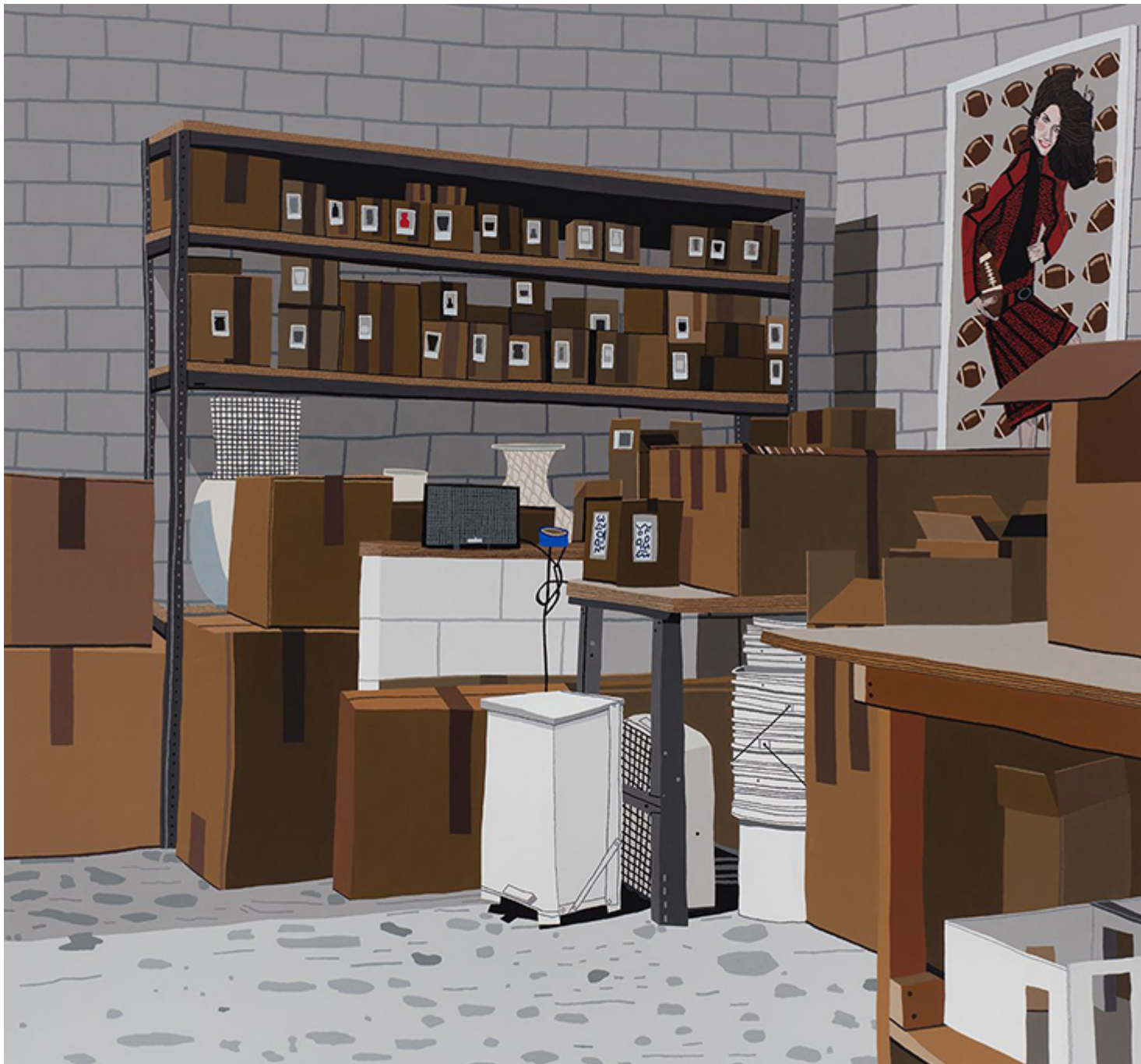
Shio's Studio on Blackwelder / Jonas Wood / 2017

FS GREY WHISPER comes in Light weight 100% Linen