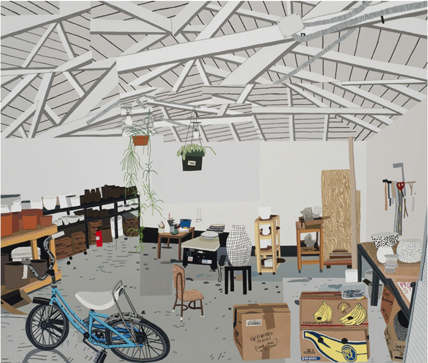
Shio's Studio on Palms / Jonas Wood / 2015