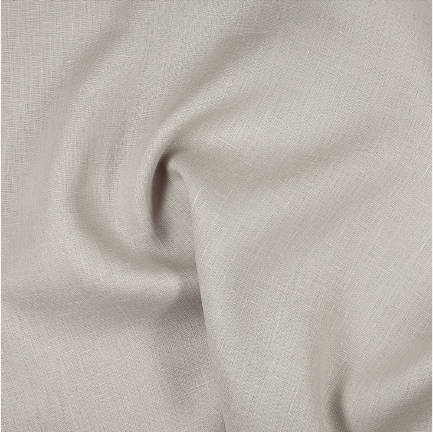
FS GREY WHISPER Softened 100% Linen